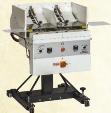
V100 HA double head pocket creasing unit