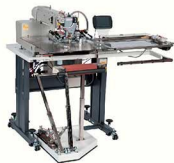
2516 V4 DCT Automatic back pocket setter