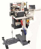
V300 Automatic waistband unit